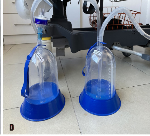
A) Ground glass density in the left lung B) Rib fractures, hemothorax C) Thoracic drain