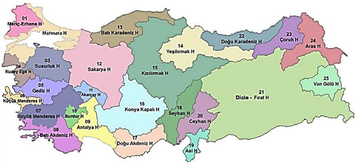
Figure 1. Maps of Turkey Major River Basins (SHW, 2012)