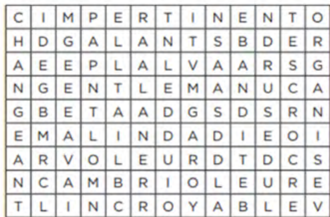
Figure 1: Puzzle of French Adjectives and Nouns That Describe Lupin

his wealthy and powerful enemies. The series presents the complex events that shape Assane’s life, the intricate storyline, and the adventurous surprises that captivate the audience. It can be highly suitable to introduce the Arsène Lupin book or the Netflix series to students at the beginner language level, also known as A1 level according to the C.E.F.R., and conduct reading activities as one of the four language skills. Additionally, the audio version of the book available on the internet, in the form of MP3 files, can be played for learners to improve their listening skills. For reading skills, below are some examples: