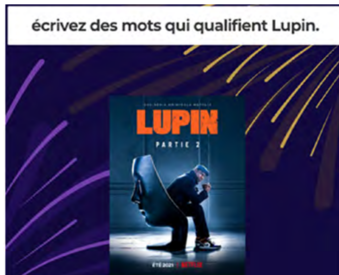
Figure 4: Kahoot! Question 4 About Lupin Series

se questions are also prepared, asking about what Lupin is doing for a living: (Q2) “Il est agent de police (He is a police officer)” (false); (Q3) “Il est voleur (He is a thief)” (true).