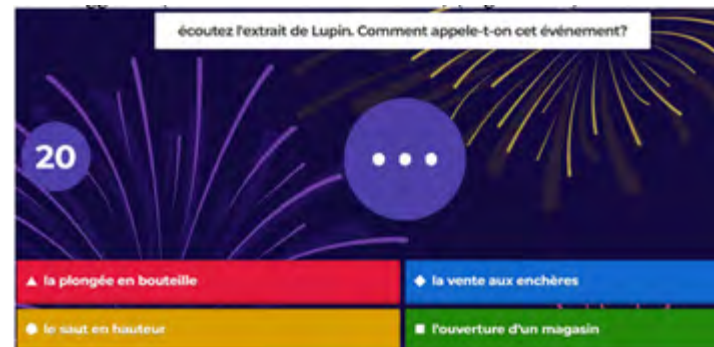
Figure 8: Kahoot! Question 8 About Lupin Series

For advanced-level students, a segment from the audio recording of the first episode of the Lupin series, related to an auction, can be provided to improve both their vocabulary knowledge and listening skills. The following question can be suggested (Answer: la vente aux enchères) (eng. auction):