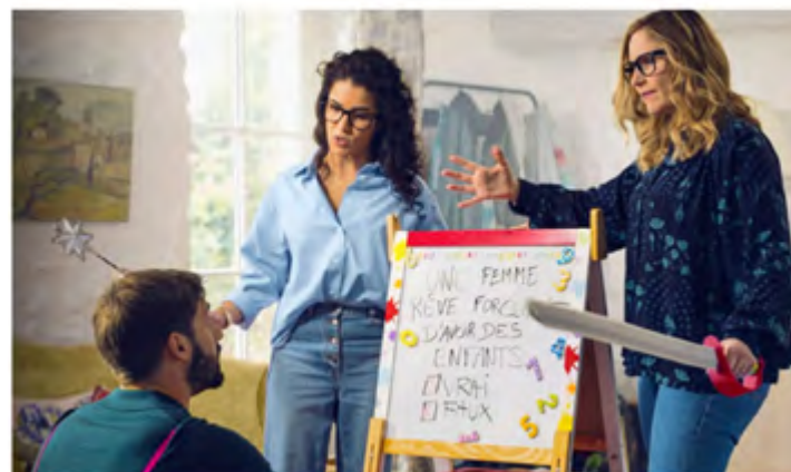
Figure 9: Photo of the Series ‘The Hook Up Plan’

Take a look at the photo below which is taken from the series ‘The Hook Up Plan’ How many people are there, what might they be talking about, what is written on the whiteboard, and what are your thoughts on this? Discuss.