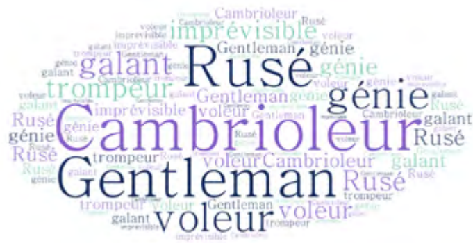
Figure 5: Word Cloud About Lupin Series

Afterwards, with multiple-choice questions like the one below, students can be asked, “Who is this?” while placing photos of Lupin’s ex-wife (question 5) and his son (question 6). With these exercises, students can reinforce how to express family bonds and relationships in a foreign language. It can be said that the following exercise enhances students’ vocabulary skills in this regard.