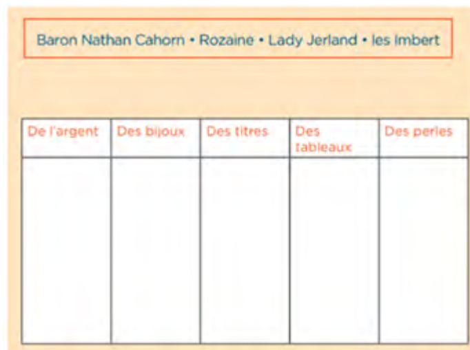
Figure 2: Reading or Listening Exercise-Lupin. Source: https://www.elionline.com/francais-fle/2351-arsene-lupin-gentleman-cambrioleur/?rc=eyJpZGMiOlsiNDgyII19

Additionally, as a reading or listening exercise, students can be guided with questions about what Arsène Lupin stole from whom, just like the ones below: