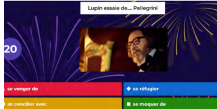
Figure 7: Kahoot! Question 7 About Lupin Series

It can be noted that the 7th question is prepared for students who have a slightly more advanced level in French and can be beneficial for enhancing vocabulary knowledge, especially regarding pronominal verbs in French.