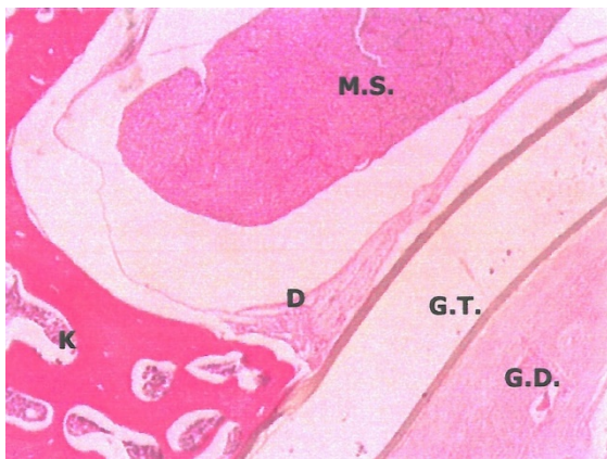
Figure 3. Although the dura mater thickens where the Gore-Tex Surgical Membrane is applied, no adhesion is observed. K, bone; G.D., granulation tissue; D, dura mater; M.S., medulla spinalis; G. T., Gore-Tex Surgical Membrane. (HE x 27.5).

The data did not show a normal distribution ( p=0.022 , the Shapiro-Wilk test). Then, it was understood that the three groups were different ( p=0.028 , the Kruskal Wallis test). Gore-Tex group was found better than both the control and the fascia group. The details of pairwise comparison results between the groups are shown in Table-2.