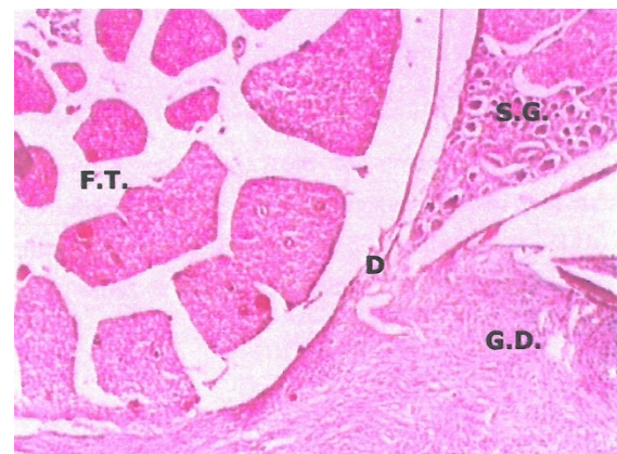
Figure 1. Findings of adhesion of granulation tissue with the dura mater and neural tissue in the laminectomy area. G.D., granulation tissue; D, dura mater; F.T., filum terminale; S.G., sympathetic ganglion. (HE x 44).

After laminectomy, dense connective tissue with fibroblasts was determined to fill the operation region in the control group. It was observed that the dura was thickened and completely adhered to the granulation tissue in the posterior (Figure 1). In the fascia group, in the histopathological examination of the levels where the fascia autograft was placed, it is seen that the dura is thickened, the operation area is again filled with dense granulation tissue, the fascia forms a barrier between the dura mater and the granulation tissue, but the fascia shows adhesion with the dura mater (Figure 2). In the Gore-Tex group, granulation tissue covered the laminectomy defect area with the Gore-Tex surgical membrane. Still, there was no adhesion to the Gore-Tex surgical membrane. In this region, it is observed that the Gore-Tex surgical membrane creates a mechanical barrier between the dura mater, neural tissue, and granulation tissue (Figure 3). Descriptive statistics of the groups are shown in Table-1.