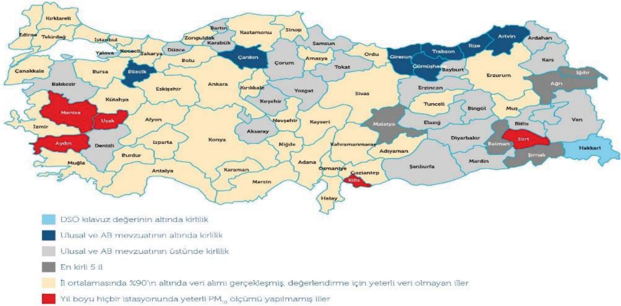
Figure-1 Pollution Level in Provinces in 2021 (Dirim 2023)