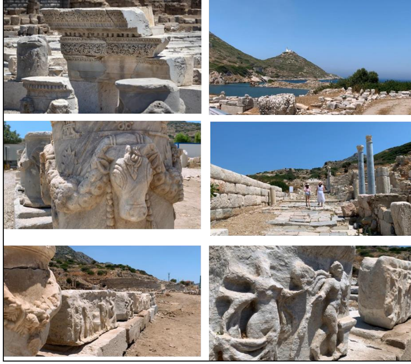
Figure 4. Knidos Ancient City ( Cumhuriyet Gazetesi, 2020 )