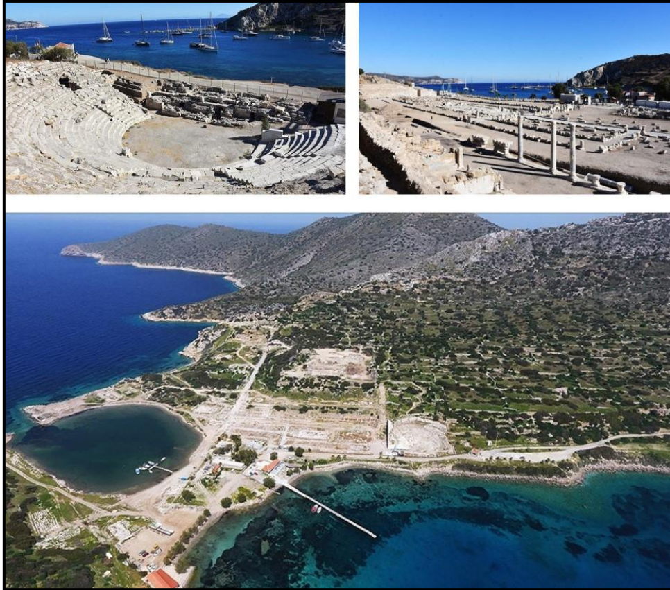
Figure 3. Images from Knidos ( Anonymous, 2023 )