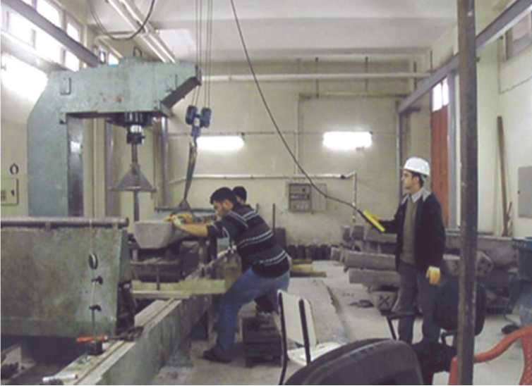
Figure 2 - A sleeper being carried to its position in the beam-loading machine (The other sleepers in stack waiting for their turns to be tested).

computations are given in [8]. The result of the theoretical analyses indicated an ultimate load of 2P = 85 \text{ kN} for the loading configuration applied during the flexural experiments [8].