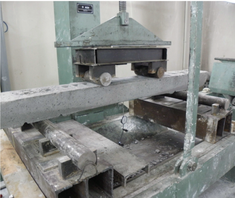
Figure 3 - A sleeper placed in the beam-loading machine in a two-point-loading position at the onset of the experiment.