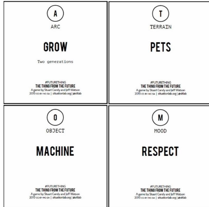
Figure 2. Thing From The Future: Print and Play Edition

The standard variation can be played with a small group of 2-5 players. A card for each letter is randomly drawn from a deck of cards. The players then write and draw their ideas on the cards for 15 minutes on a table which is part of the game. Then everyone shares their future scenario with the group members. Players can choose their favourite future scenarios and give the cards used in that round to the winning player. Another type of gameplay can be with the participation of more players and the exchange of cards. Or players can discuss ideas out loud and transfer them to paper. In this way, a co-operative exchange of ideas takes place within the framework of fun. Another alternative is to have a guide, called a facilitator, select the cards and manage the process in a large group of players. Finally, players can play the game by writing their own words or design problems instead of choosing some cards.