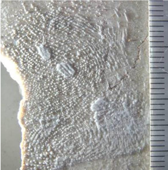
Fig 3. The image of the fingerprint on a marble surface subsequent to cyanoacrylate fuming method application after holding for 3 days