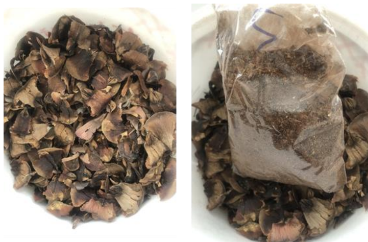
Figure 1. Supplied Abies nordmanniana subsp equi-trojani cone spangles and ground powder

The extraction process of the Ida Mountain A. nordmanniana subsp. equi-trojani cone was carried out using four different solvents: distilled water (DW), methanol (M) (Merck, Germany), ethanol (E) (Isolab, Türkiye), and dimethyl sulfoxide (DMSO) (Merck, Germany). For the extraction of the cone, a 40 g spangle and a 10 g high-speed ground spangle (Figure 1) were mixed, and a 1:10 (w:v) solvent was added. The mixture was then extracted with Soxhlet for 24 hours. After extraction, the extracts were filtered using sterile filter papers, placed in sterile dark-colored bottles, and stored at +4°C.