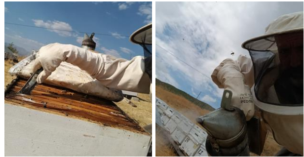
Figure 5. Wrist working in a non-neutral position during the use of hand tools.

and bee brush are also frequently used hand tools in beekeeping. Continuous and repetitive hand movements can lead to carpal tunnel syndrome over time. Carpal tunnel syndrome causes numbness, tingling and pain in the hand as a result of compression of the nerves on the inside of the wrist [17]. Measures such as maintaining a neutral wrist posture during beekeeping activities and taking periodic rest breaks are important to reduce the risk of beekeepers encountering such health problems.