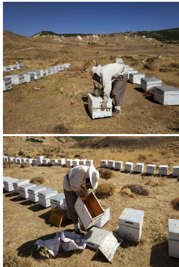
Figure 1. Wrong lifting procedures that threaten spinal health

shown schematically in Figure 2, the principle should be to approach the load by bending the knees to keep the body as upright as possible and to perform the lifting process using the leg muscles. Beekeepers should be informed about this industrial lifting principle. Thus, it will be possible to prevent spinal disorders that may be caused by load lifting. Another measure that can be taken to prevent the torso from leaning forward during the lifting of the hives is the use of stands with a height suitable for the anthropometric characteristics of the beekeeper. What is meant by the appropriate height here is that the handles of the hive should be raised to a level between the beekeeper's fingertips and waist. In this way, the beekeeper will be able to grasp the hive by keeping his body upright and will be relieved of large loads that may affect the cartilage discs between the vertebrae during lifting from the ground.