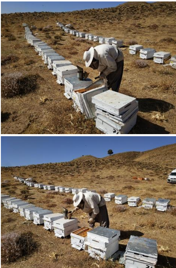
Figure 4. Working in the wrong body posture during bee care

Beekeepers have to working in a standing posture for long periods of time during bee care and honey harvesting processes, which can adversely affect musculoskeletal health. Prolonged standing without adequate rest breaks may lead to joint disorders, back pain, swelling in the feet and legs and muscle fatigue, as well as heart and circulatory disorders [16]. Working in a sitting posture is not an alternative to working in a standing posture. It is useful to sit, walk and do stretching exercises intermittently to prevent the adverse effects of prolonged standing [7].