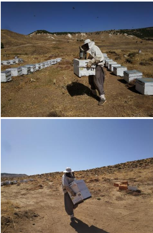
Figure 3. Transportation of heavy loads in beekeeping

Figure 3 depicts images related to the transportation of heavy loads in beekeeping work. Carrying or supporting heavy loads under inappropriate ergonomic conditions increases the risk of injury [11]. Two different groups of injuries can occur in handling operations using the hands. The first group includes cuts, bruises, and fractures resulting from accidents, while the second group comprises musculoskeletal injuries [12]. Musculoskeletal injuries can affect muscles, tendons, ligaments, joints, nerves, blood vessels or related soft tissues as a result of incorrect body posture, repetitive movements and vigorous exertion [13]. These injuries often lead to decreased work performance among employees, consequently reducing the quality and efficiency of their work. Most beekeepers complain of fatigue, back pain, upper body and neck pain, hand or arm pain due to manual material handling [7]. In addition, muscle fatigue and pain in the shoulders may occur as a result of weight bearing and increased duration of this carrying [14]. Local muscle fatigue is a result of increased intramuscular pressure and decreased blood flow in the muscles of the upper extremities as the arm is lifted. Restriction of muscle blood flow impairs muscle metabolism and increases metabolite accumulation, thus causing muscle fatigue [15].