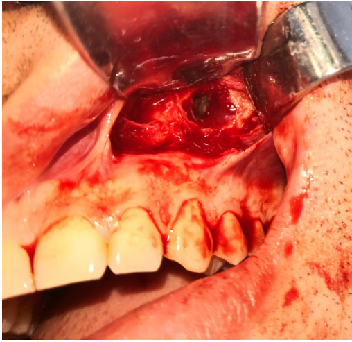
Fig. 2. Caldwell-Luc surgery in the left maxillary sinus.

performed with the Caldwell Luc procedure. (Fig.2) After the procedure oral antibiotics, analgesics and nasal decongestants were prescribed. In addition post-operative sinus precautions were explained to the patient and he was followed up for 3 years and no complaints received (Fig. 3)