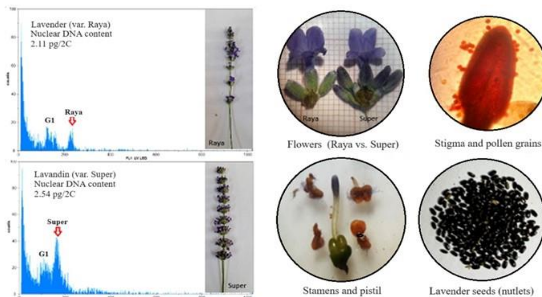
Figure 2. Flow cytometer histograms and generative reproductive organs of lavender (var. Raya) and lavandin (var. Super).

According to the results of the flow cytometer analysis, it was determined that the nuclear DNA amount was 2.11 \text{ pg } 2C^{-1} in the lavender cultivar and 2.54 \text{ pg } 2C^{-1} in the lavandin cultivar (Figure 2; Table 1). Indeed, in a comprehensive karyotype study conducted on a total of 82 genotypes in the Lavandula , Stoechas , Dentatae , Pterostoechas , and Subnudaeda sections of lavender, it was reported that the genome size ranged from 0.76 to 4.80 \text{ pg } 2C^{-1} and the chromosome numbers varied between 22 and 100 (Van Oost et al. 2021). In the same study, it was explained that the 2n chromosome number of L. x intermedia 'Heavenly Angel' genotype was 100. The chromosome numbers of species belonging to Lavandula subsection have been determined as 2n=34, 36, 42, 48, 50, 54, and 75 (Garcia 1942; Darlington and Wylie 1955; Upson 2004; Rice et al. 2015). It has been reported that there is a close relationship between the genome size ( 2C values) and chromosome number of the species in this section, and that those with high nuclear DNA amounts also have a higher number of chromosomes (Van Oost et al. 2021).