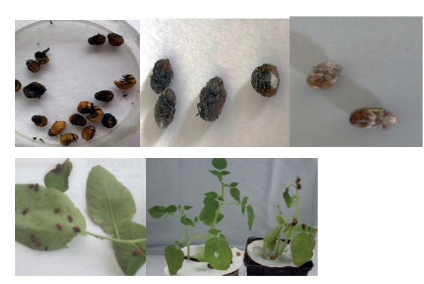
Figure 2. Pathogenicity trial of the obtained entomopathogenic fungi

The efficacy rates of 30 different entomopathogenic fungi used against the potato beetle exhibited a range from 75% to 20%. To assess the significance of differences between the entomopathogenic fungal isolates, One-way ANOVA and the Duncan test were applied to the data. The statistical analyses resulted in the categorization of entomopathogenic isolates into three distinct groups based on their impact levels. These groups were designated as highly effective (a), moderately effective (b), and low (c), as outlined in Table 2.