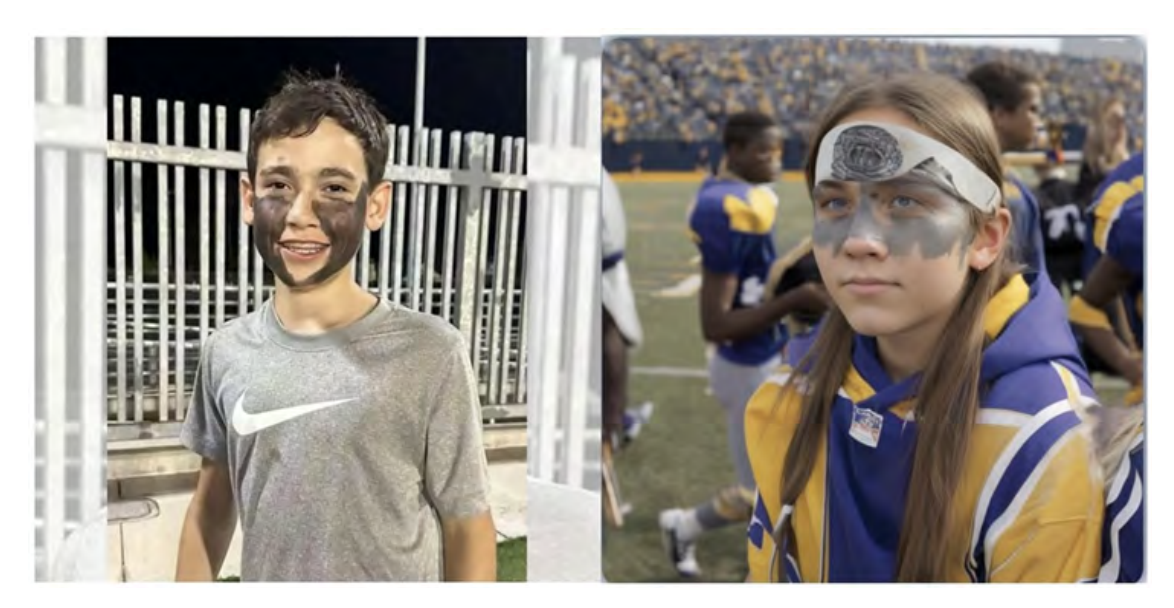
Figure 2 News photo used by Foxnews (left) "California Family", 2024) and news photo used by NewsGPT (right) "Middle School", 2024)

Another problem observed in NewsGPT's news is the timeliness of the news. For example, the earthquake in Turkey on February 6, 2023 was reported in NewsGPT nine months after the event. Reading the news article dated November 22, 2013 and titled "Devastating Earthquake Hits Turkey and Syria, Causing Widespread Destruction and Loss of Life" ("Devastating Earthquake", 2023), it is perceived as if the earthquake had just occurred, even though the time of the earthquake is not mentioned. The following sentences are included in the news report: "The death toll from the earthquake has been rising steadily, and it is feared that thousands may have lost their lives. Many more have been injured, and hospitals are struggling to cope with the influx of patients." However, the number of deaths in November 2023 is known, and hospitals are not struggling with the problem. The fact that the news is outdated may also mislead the reader.