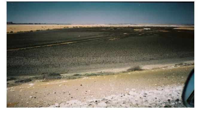
Fig. 2. Photograph of a drying sewage sludge used as fertilizer.

The biosolid land application generates bioaerosols through soil agitation and weathering of biosolid. Biosolids left on the soil surface are subjected to drying; rendering it friable, becoming airborne with the associated pathogens (Pillai 2007). At a municipal solid waste recycling and composting plant stations in Quebec, Canada, the concentrations of airborne total culturable bacteria and Gram-negative bacteria were above 10<sup>4</sup> CFU/m<sup>3</sup> and 10<sup>3</sup> CFU/m<sup>3</sup>, respectively, at six of the nine work stations (Marchand et al. 1995). Salmonella and Enterobacter bacteria were found in the air samples only in the vicinity of the compost piles in Poland (Breza-Boruta & Paluszak 2007). The generation and disposal of bio-wastes potentially increase aerosolization of a wide variety of microbial pathogens.