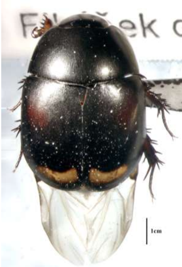
Fig. 2. Dorsal habitus of S. lunatum .

Croatia, Russia, Central European Territory , Czech Republic, Denmark, Estonia, Finland, France (incl. Corsica, Monaco), Great Britain (incl. Channel Islands), Germany, Hungary, Italy (incl. Sardinia, Sicily, San Marino), Latvia, Lithuania, Macedonia, Moldavia, The Netherlands, Norway, Russia, North European Territory , Poland, Portugal, Slovakia, Slovenia, Spain (incl. Gibraltar), Russia, South European Territory , Sweden, Switzerland, Ukraine, Serbia and Montenegro, North Africa: Algeria, Canary Islands, Egypt, Tunisia, Asia: Afghanistan, Russia: East Siberia, Israel, Kazakhstan, Mongolia, Tajikistan, Turkey, Russia: West Siberia, America: North of Mexico (Fikáček et al. 2015).