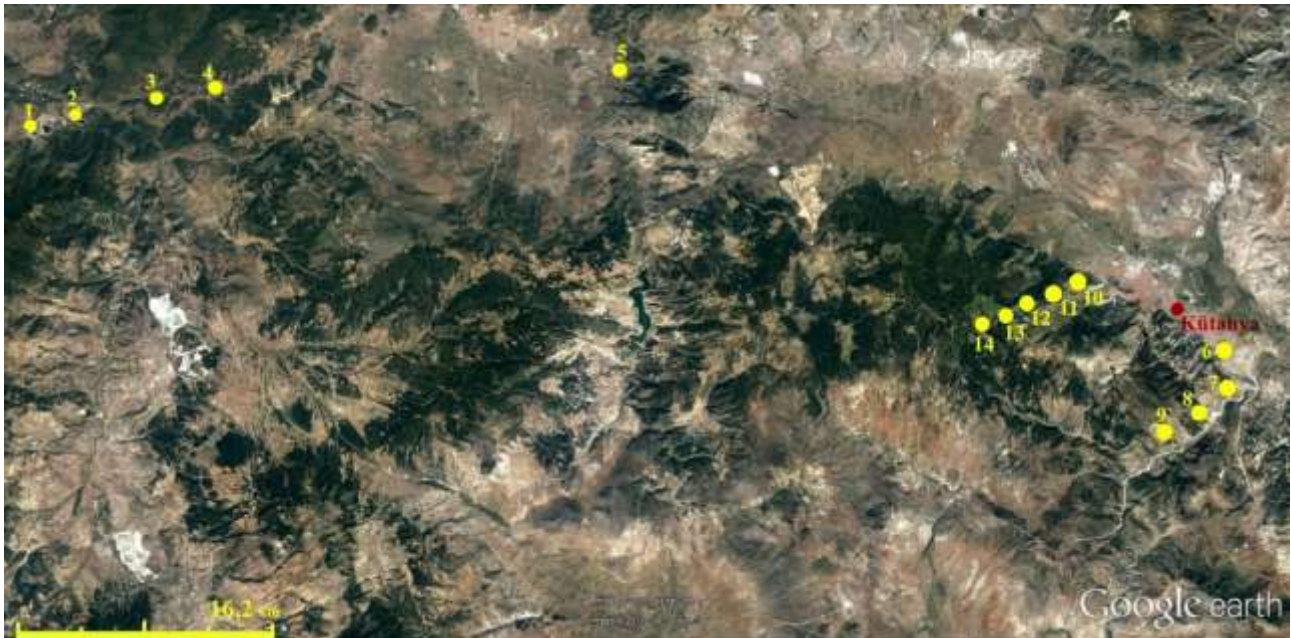
Fig. 1. The sampled localities in study area. Each number represents a single locality.

Samplings were performed from June 2010 to May 2011 in 14 different localities within the study area with altitudes ranging from 469m to 1810m. Altitudes and geographic coordinates of the sampling localities are given in Table 1. A single sampling station was chosen for each locality and samplings were performed in a manner to keep an average of 100m altitude increase from one to another locality (Table 1). All specimens were collected by using baited pitfall traps with 1,000gr of fresh cow dung. The trap consisted of a plastic bucket (20cm in height and 25cm in diameter) buried in the soil with its rim at ground level. The upper part of the trap was filled with fresh dung placed on a wire mesh. Water, liquid detergent and 4% formaldehyde was used as the preserving fluid. Traps were placed in the field for 3 days (72 hours) each month from June 2010 to May 2011.