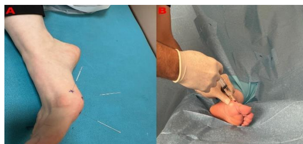
Figure 2. A) dry needling method, B) prolotherapy procedure