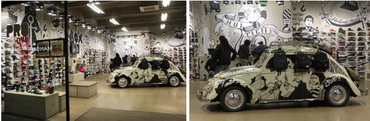
Figure 3: PRO 010 Retail Store, Amsterdam

Experience-oriented thematic approaches are also frequently seen in common usage area designs of shopping malls. Forum Shops that were designed as ancient roman markets may be given as examples of spaces that provide aesthetical experience where a certain time period or a concept is depicted. In this shopping mall opened in 1992 in Las Vegas, the architecture and all peripheral elements are supportive of the theme in question. Another example of thematic areas in shopping malls is the İstinye Market located in the İstanbul İstinyepark shopping mall. The walls that resemble building facades in the space and counters selling fruits and vegetables represent the concept of district bazaars. With the barrisol material used in the ceiling of the area, it was aimed to create an atmosphere like walking in open space.