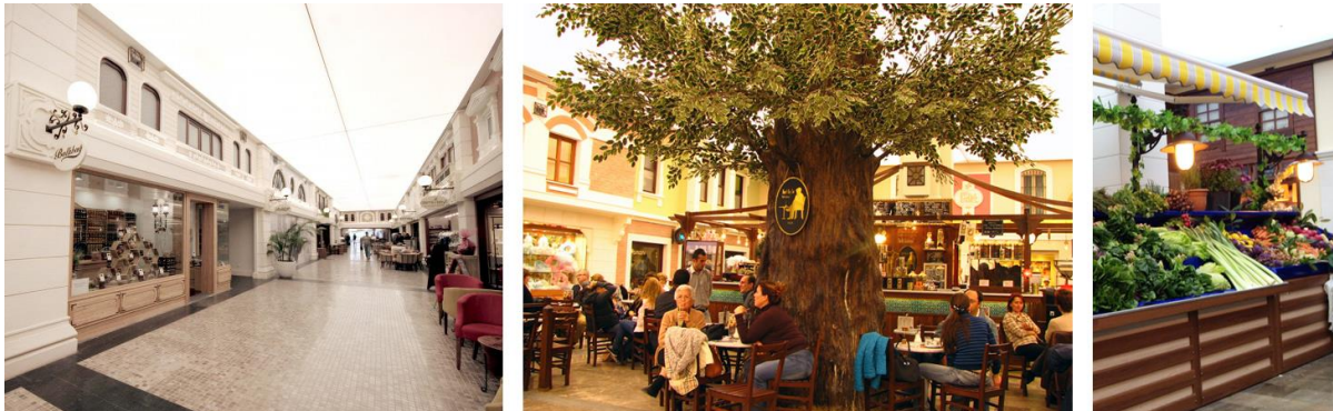
Figure 4: İstinyepark Bazaar

Retailers that sell outdoor sports materials such as Bass Pro Shops Outdoor World, Recreational Equipment Inc., Cabela's include elements that are for sports activities or hunting in their store designs and try to create a theme of 'adventure' in their space. Bass Pro Shops designed their store as a forest, and REI built a mountain of 15-metre height for people to test their climbing materials. In the Cabela's store located in Minnesota, there is a 10-metre-high mountain with an artificial waterfall and wild animals that were taxidermized after shooting. Climbing walls that provide an experience of entertainment for both participants and watchers have recently been see frequently in shopping malls, university campuses and public areas.