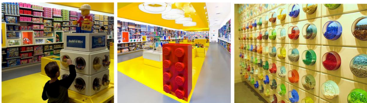
Figure 2: Images From Lego Stores

Affectualisation of products is one of the most direct ways of making the products heuristic. This is possible by adding elements that will lead the customer to start a sensory interaction with the product. While usage of examples such as toys, Lego blocks, candies lead to a direct sensory experience, some firms achieve appreciation by using symbolic products in their spaces. Producing objects in exaggerated dimensions is a frequently used method in this matter. Production of the world's largest Duct Tape by the firm Duct Tape and exhibition of it in a store lead the customer of the firm to look at this