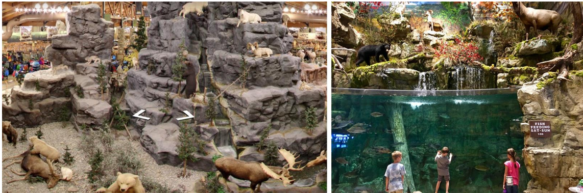
Figure 5: Photos from Cabela's and Bass Pro Shops stores