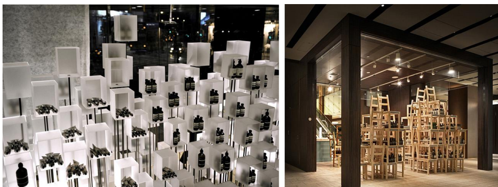
Figure 6: Hong Kong Aesop Retail Store and Tokyo Aesop Pop-up Store

In addition to the technological advancements of today, the factor of experience in commercial spaces also vary, and brands are increasingly interested in virtual reality / augmented reality applications. While interactive spaces contribute to customers playing an active role in the store, they allow achieving the relationship with products to different extents. Nokia's store in London is a digital installation that is experienced by customer participation. It is also an indicator that institutions have started to pay importance to experimental interactive designs in the process of building brands. Translucent panels and LCD screens in the space allow customers to change the in-store appearance by using the function