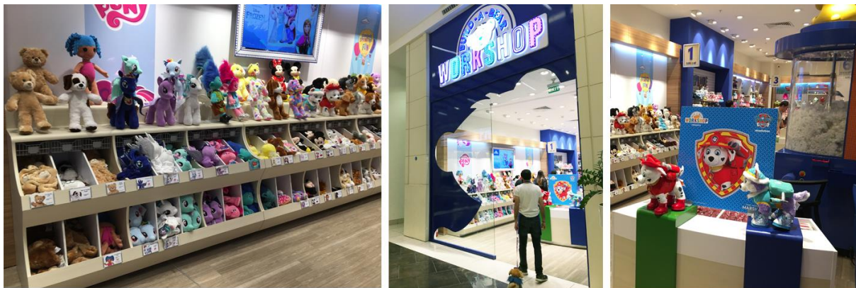
Figure 1: Build a Bear Workshop Retail Space, Akasya Shopping Center, Istanbul