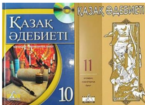
Figure 2. Kazakh literature textbook outer cover

The content organisation of both books includes the imprint page, preface, chapters, literary theory, literature used, table of contents, inner cover. 10th grade Kazakh Literature textbook consists of four chapters: "Poetry is the King of Words", "Artistic Thought in Prose", "The Artistic Word, Weaved with Myth", "Time, the People of the Age". 11th grade Kazakh Literature textbook also consists of four chapters: "Key to History", "Decision and Reason", "Centenary Work", "Criticism in Literature".