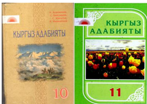
Figure 3. Kyrgyz literature outer cover

In the content organisation of the book, there are the state coat of arms and state flag of the Kyrgyz Republic, national anthem, inner cover, introduction, chapters, table of contents on the first page.