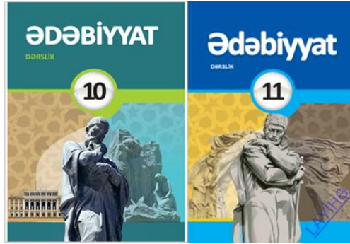
Figure 1. Azerbaijan literature textbook outer cover

In the content organization of both books, Azerbaijan Flag and National Anthem, Heydar Aliyev Portrait, Inner cover, Titles, Chapters, Traditional Signs Used in Literal Reading, Glossary, Short Glossary of Literary Terms, We Recommend You to Read, References, Imprint Page are included.