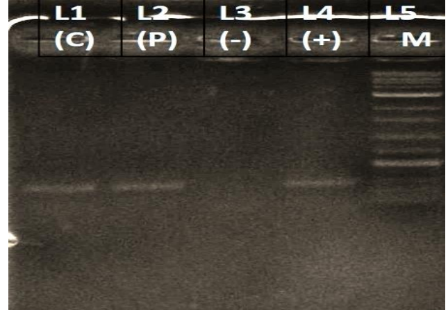
Figure2. A 276 bp RT-PCR product of TSWV was amplified and visualized on agarose from collected samples at Kumluca district. Lane 5- M: contain 100 bp DNA marker; Lane 1, 2: typical symptomatic cress and pepper plants respectively; Lane 3: negative control, Lane 4: positive control.

cycles for positive control but there was no Ct value for negative control (Figure 3).