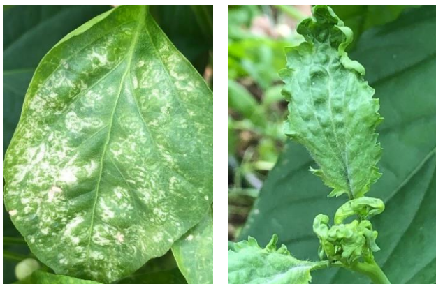
Figure 1. Minor mosaic and spots on pepper (left side), crinkling and leaf deformation on cress (right side) due to TSWV infection.

Şekil 1. TSWV enfeksiyonuna bağlı biberde küçük mozaik ve lekeler (solda), tere yaprağında buruşma ve deformasyon (sağda).