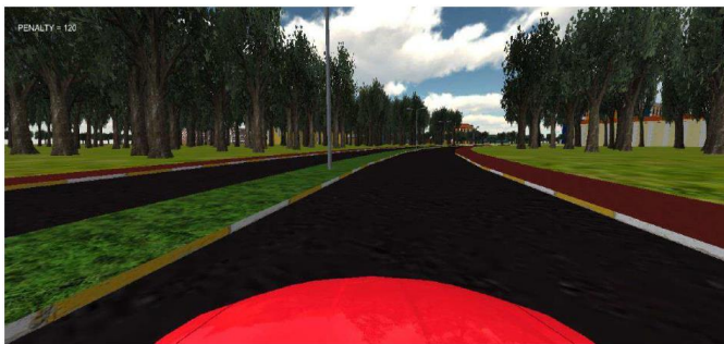
Fig. 5. An example view of the stage of the simulator

There are penalty points for traffic violations in our scenario. The penalty points were determined by examining the guide, which is available on the website of Turkish National Police Traffic Services Department [16]. An example of such possible violations is “failure to comply with the rules of the red light”, a twenty penalty points violation according to the penalties guide. Another example of a twenty penalty points is “failure to comply with traffic signs”. Using those criteria, we determined all penalty points for each violation in the simulator.