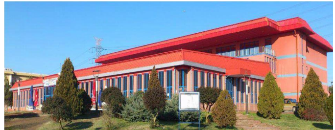
Fig. 1. A photo of the Sakarya University Center Cafeteria

the 3D models (road, building, etc.) were exported with ".fbx" file extensions. The buildings were later combined with the game engine.