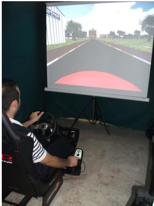
Fig. 4. The virtual driving simulator

There are penalty points for traffic violations in our scenario. The penalty points were determined by examining the guide, which is available on the website of Turkish National Police Traffic Services Department [16]. An example of such possible violations is “failure to comply with the rules of the red light”, a twenty penalty points violation according to the penalties guide. Another example of a twenty penalty points is “failure to comply with traffic signs”. Using those criteria, we determined all penalty points for each violation in the simulator.