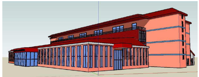
Fig. 2. A 3D model of the Sakarya University Center Cafeteria

The virtual original campus does not possess enough elements; therefore, a more complex scenario was required for driving education. For instance, signaling systems were installed at the junctions; new signs were added in the virtual campus according to the scenario. In addition, the simulator needed a car after the creation of the virtual environment. We used one of the ready to use cars from the Unity Asset Store car tutorial. The car was then, combined with virtual environment.