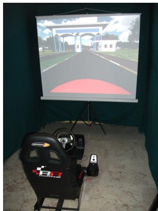
Fig. 3. The virtual driving simulator

The virtual original campus does not possess enough elements; therefore, a more complex scenario was required for driving education. For instance, signaling systems were installed at the junctions; new signs were added in the virtual campus according to the scenario. In addition, the simulator needed a car after the creation of the virtual environment. We used one of the ready to use cars from the Unity Asset Store car tutorial. The car was then, combined with virtual environment.