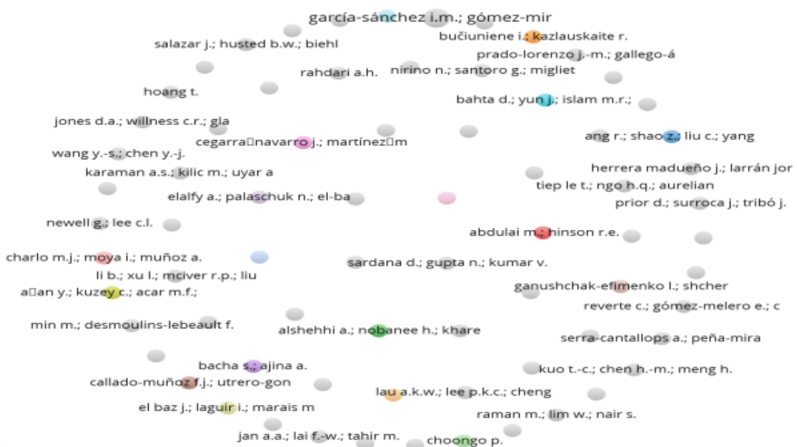
Figure 2: Top Cited Authors on CSR Research

Citation analysis is necessary to determine research area main studies .Figure 2 shows the most cited studies in the field of CSR .It is observed that work of Garcia Sanchez and Gomez Mir has 2 documents with 72 citation and prior .d surroca, J tribo j.a has the highest number of citations (507) .Figure also shows the density of the number of citations to other authors according to the size and colour of the circles.