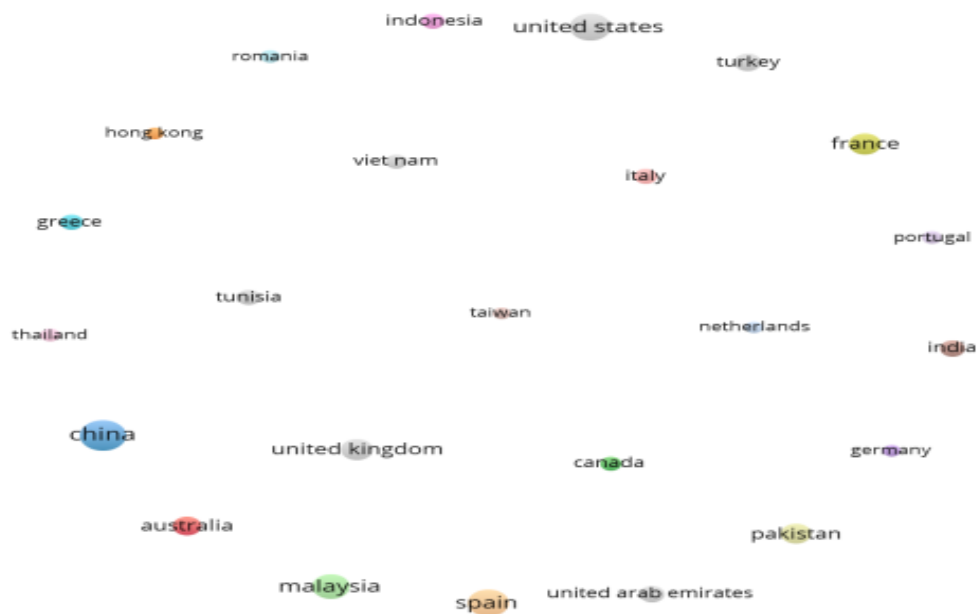
Figure 4: Contribution of Top 10 Countries in CSR Research

Based on published articles and country of origin of authors, 24 countries are represented in this research topic. It is observed that the prominent countries are China (29), Spain (23), United States (23), and Malaysia (19).