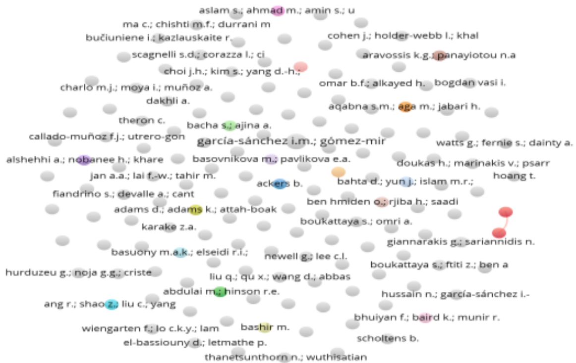
Figure 1: Co-Authorship of CSR Research in Scopus Database