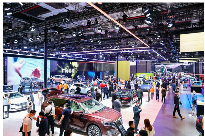
Image 6. Auto fairs attract great attention today.

Trade exhibitions are venues where products and services from various industries are displayed. These events provide a platform for companies to introduce new products, generate leads, and network with potential customers. They are places where sales, partnerships and exchange of views occur within a narrower pool of participants, especially in professional work areas. Participants include industry professionals, buyers and occasionally the public. An example of a famous trade show is the Consumer Electronics Show (CES), held annually in Las Vegas. This event showcases the latest technology and future products from various companies, providing vision for the industry. In the automotive field, International Automobile Fairs held in different cities of the world, featuring the latest automobiles and automotive technology, can be given as successful examples (Image 6).