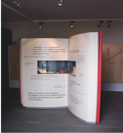
Image 11. An applied exhibition design in a museum in Italy.

ence between exhibition and exhibition actions is narrative. An artistic exhibition has content, but since the content there does not aim to communicate perfectly, the destinations are not the same. In this case, the main difference between exhibition and exhibition, which are two actions with similar characteristics, is that exhibition has a narrative written according to basic elements such as target audience, content, and exhibition space (Image 11).