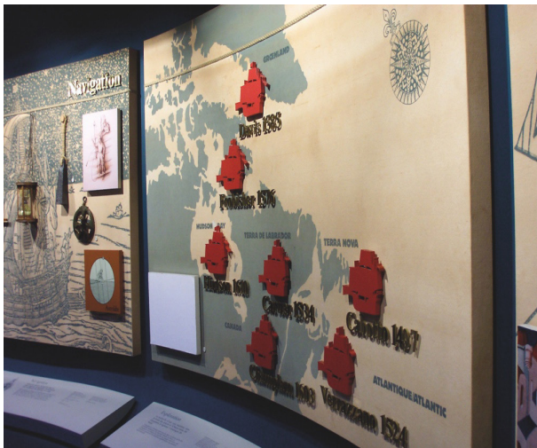
Image 12. An applied exhibition design in a museum in Canada.

To move on to the visual design phase in exhibition design, the narrative must be created. Just like in poster design, exhibition design aims to express the narrative correctly and capture the audience (Eken & Taluğ, 2023, p. 31). Visual design elements can be photographs, drawings, patterns, and information visualization graphics. Visual design is presented together, supported by text to the extent required by the content. Since the application area is large and voluminous, unlike paper, headings, subheadings, and body text are treated as visuals and positioned on the work area. However, unlike graphic design, exhibition design includes three-dimensional objects or three-dimensionally designed graphics. To constantly attract the attention of the audience, animations that can give a three-dimensional effect are made on the wall, unlike graphics on paper (Image 12).