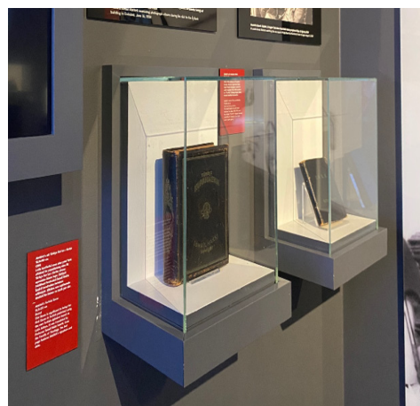
Image 3. Works are shown and highlighted by labeling.

When the concept of exhibition is examined in terms of communication models, it can be said that it has a one-sided communication model. In other words, the artist or producer, who is the starting point of the exhibition, introduces his work or product to the audience and thus the communication process is completed. In the exhibitions, there are tags of the works or products, so that the users can get information. However, it is not possible for users to give feedback or improve the information they have acquired through the exhibition and thus continue the flow. When evaluated operationally, the exhibition appears one-sided and passive (Image 3). The exhibition cannot be considered as a feedback venue. Exhibitions that aim to win the hearts and minds of visitors and involve them in current news and events have both informative layers that encourage learning and sensory layers that encourage empathy (Message, K. and Witcomb, A. 2015, p. 48).