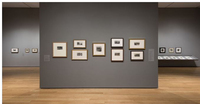
Image 2. An example of a gallery. Source

As can be seen from the above explanations and examples, exhibition is a concept with a wider field of activity than thought. Works produced for purposes such as sales and promotion are also exhibited and presented to people. A promotion that will last only three days at a fair or a presentation of archaeological artifacts to the audience in a museum is an exhibition. It can be said that the word originates from the predicate to spread. Spreading does not make everything you have visible; showing it is an action that has a strong counterpart in outward communication. The word exhibition, derived from the act of laying, describes the way in which this action is carried out. It is not necessary for it to be visible, but it is essential that everything be shown and/or made visible.