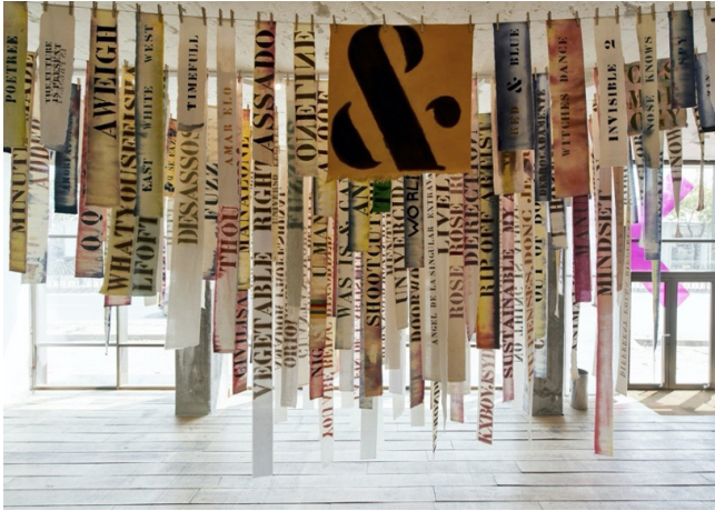
Image 4. An example of a didactic exhibition: A work from the Istanbul Design Biennial.

Although exhibition is one-sided, it has an intense flow of conceptual information. Those who come to watch artistic exhibitions can learn about general culture, social events, gaining perspective on life, etc. They encounter content and are nourished by these contents. However, those who watch industrial exhibitions such as fairs can experience a vision for the future, a new commercial expansion, etc. They have knowledge on the subject. The exhibition is instructive and informative even at its most closed to mutual interaction (Image 4).