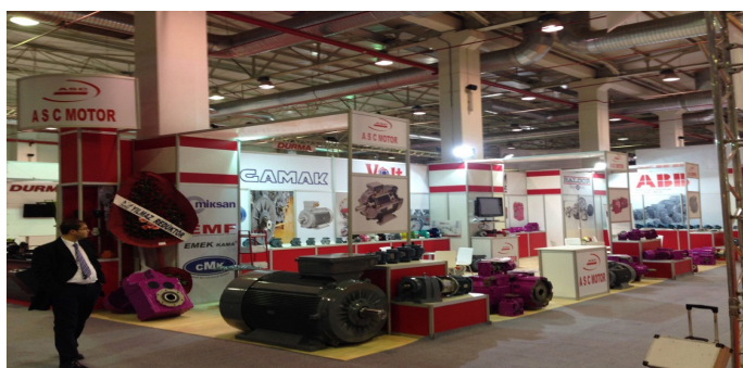
Image 1. Example of Trade Exhibitions. Source

Exhibition, in its literal sense, is not a concept that people are unfamiliar with. Since it is a highly visible event, it has a clear meaning in the minds of people living in today's world, especially those interested in art and culture. If we want to give a general definition, an exhibition is the presentation of existing or new products or works in an open or closed space, within a limited or open-ended period, within the context of a certain theme or subject, in a way that the audience can see and experience firsthand. It is generally called an exhibition when experts/artists bring together the products/works they produce within a certain theme with art lovers in an exhibition area/art gallery (Image 1).