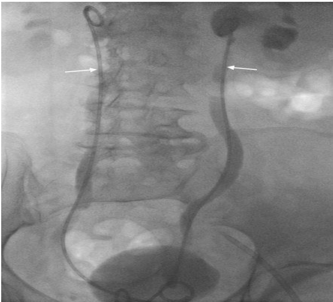
Figure 1. Antegrade double J stent placement (white arrow) into the ureter without a nephrostomy catheter

In this study, we evaluated the relationship between postoperative nephrostomy and the presence of hematuria in patients who underwent antegrade double J stent (ADJS) placement. The descriptive statistics and comparisons based on the presence of hematuria are presented in Table 2.