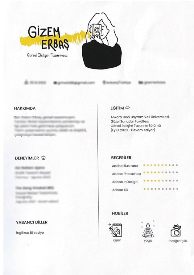
Figure 5. Erbaş, Gizem. With Permission, (2024). Portfolio Design. Ankara, Türkiye: Ankara Hacı Bayram Veli University, GSF, Department of Visual Communication Design Portfolio Design Course Project.

In the other self-portrait analyzed, the student created his self-portrait with a primitive understanding (Figure 5). In order to approach the visual language of the illustration, he wrote his name in his own handwriting and succeeded. At the same time, the icons under the heading 'hobbies' have a visual language in harmony with the illustration. It can be said that spaces are used very effectively in this background. The use of spaces clearly separates the categories from each other. This makes eye tracking and readability much easier. Considering that the most fundamental feature of a résumé in terms of design is to be attention-grabbing and readable, this simple and legible résumé can be counted among successful examples. The student's self-portrait drawing and handwritten name help to showcase their skills related to the field.