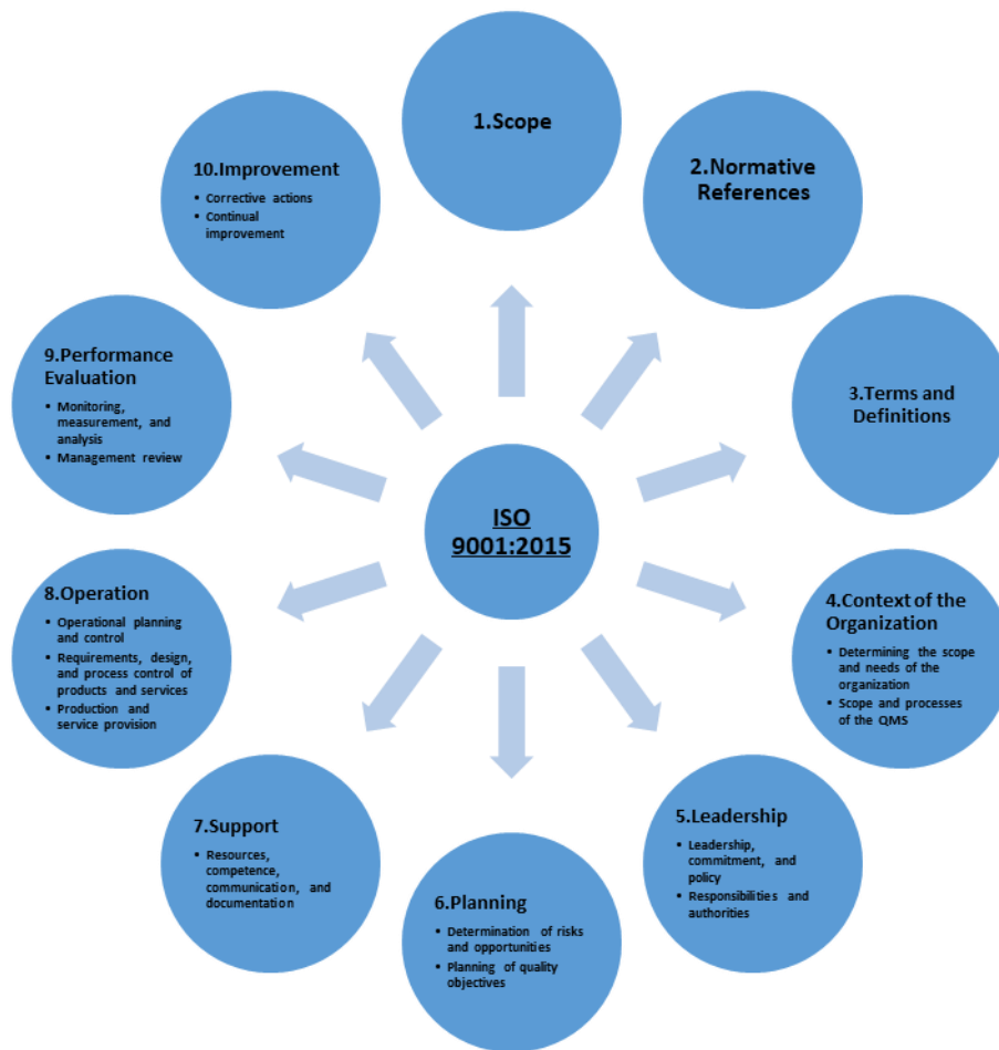
Figure 1. ISO 9001:2015 Sections