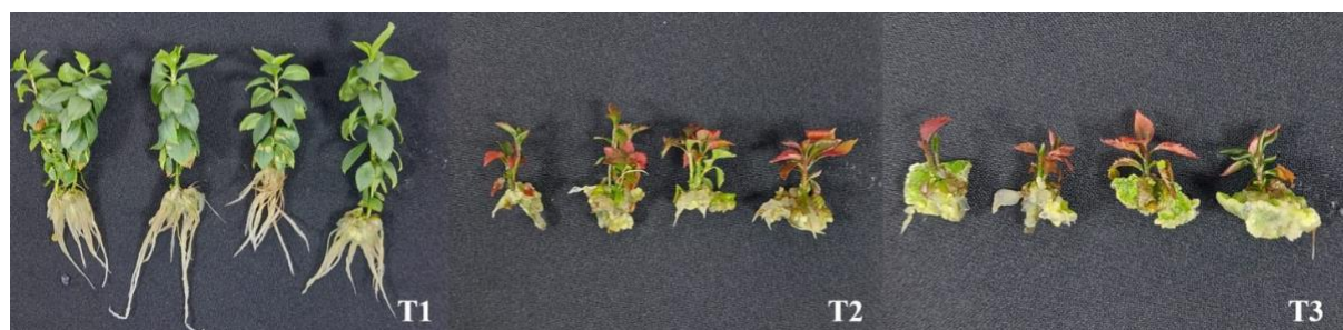
Figure 1. Development of plantlets exposed to PEG-8000-induced drought stress in vitro . T1: 0% PEG-8000, T2: 1% PEG-8000, T3: 2% PEG-8000