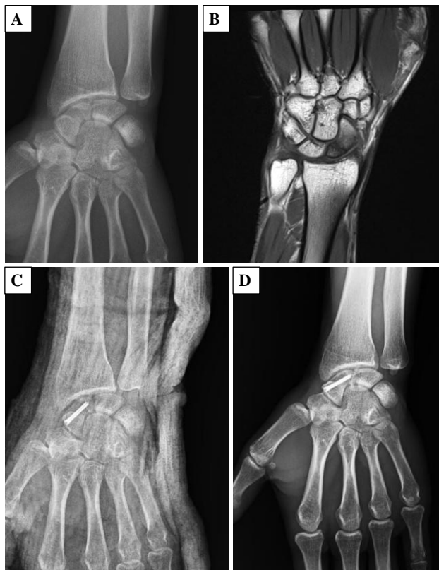
Figure 1. Long-term radiographic follow-up of a 29-year-old male patient who underwent scaphoid proximal pole nonunion surgery. A) Anteroposterior wrist radiograph, B) Coronal magnetic resonance imaging at 11 months after trauma (preoperative), Anteroposterior wrist radiograph C) 1 day, and D) 50 months after surgery with the complete union of the scaphoid

In all patients, the wrist was immobilized with a short arm splint for 6 weeks to allow for the healing of the soft tissues and radioscaphocapitate ligament after surgery, and then all patients underwent wrist rehabilitation with the same physical therapy protocol.