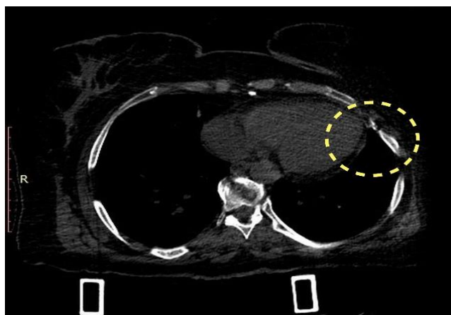
Figure 1. Computed Tomography section showing a suspected displaced rib fracture on the left side

A 56-year-old female presented to the emergency department following a low-energy trauma, specifically a fall from the same level. Upon initial evaluation, the patient reported localized pain in the upper left side of her chest, specifically around the upper portion of the costal margin. There was no significant history of prior chest trauma or congenital anomalies related to the skeletal system. A chest X-ray was performed to assess for possible fractures, and the initial radiograph raised suspicion of a fracture in the left seventh rib. Due to the inconclusive findings on the X-ray and ongoing pain, further imaging with a thoracic CT scan was deemed necessary.