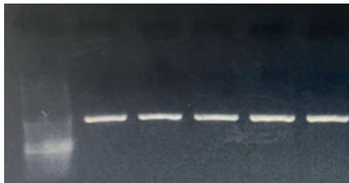
Figure 1. Electropherogram of 400 bp PCR products

All of the DNA samples obtained were amplified by PCR (Figure 1), but the sequence analysis results of 37 of them were found suitable for evaluation.