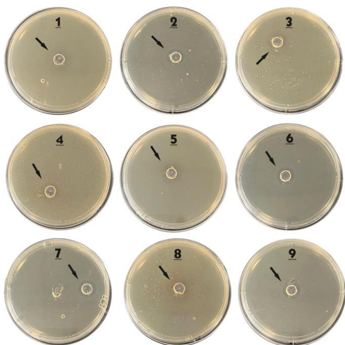
Figure 2. Inhibition Zones 1; Salmonella typhimurium . 2; Staphylococcus epidermidis . 3; Pseudomonas aeruginosa . 4; Yersinia pseudotuberculosis . 5; Proteus vulgaris . 6; Enterococcus faecalis . 7; Enterobacter cloaceae . 8; Escherichia coli . 9; Listeria monocytogenes .

Studies have shown that resveratrol has an inhibitory effect against various Gram (+) and Gram (-) bacteria. Some research has indicated that resveratrol exhibits antibacterial activity against Staphylococcus aureus , particularly antibiotic-resistant strains (MRSA), as well as E. coli and Pseudomonas aeruginosa . Resveratrol is being investigated for its direct antibacterial properties against antibiotic-resistant bacteria and as a potential adjunctive therapeutic agent (Paulo et al. 2010; Vestergaard et al. 2019).