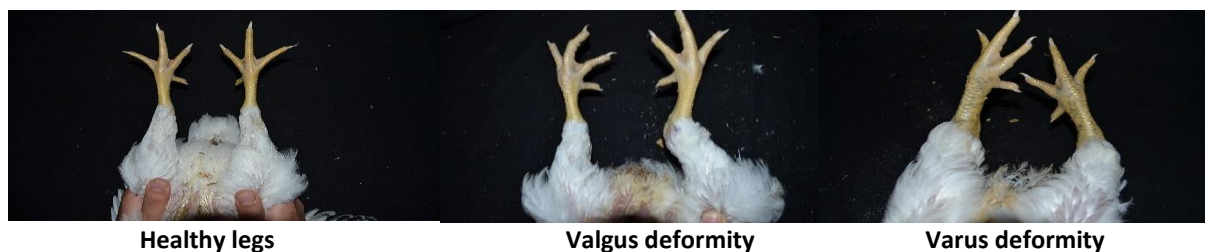
Figure 1. Healthy leg, valgus and varus deformities in broilers

For valgus-varus deformity (VVD) and gait score (GS), 56 birds of each genotype were used at 28, 35 and 42 days. The angulation (in degrees) of the tibiotarsal-tarsometatarsal joint was measured separately in both legs using a digital goniometer to determine VVD. One end of the goniometer was placed parallel along the tibio-tarsus, while the other end was placed parallel along the tarso-metatarsus (van den Brand et al. 2022). All measurements were performed by a single person. Illustrations of healthy leg and valgus and varus deformities are shown in Figure 1.