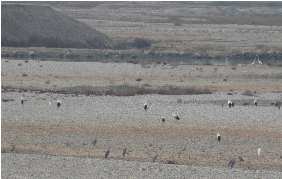
Figure 2. A group of White-storks together with Grey heron ( Ardea cinerea ) and Great heron ( Egretta alba ) between Diyarbakir-Batman provinces at 4 December 2021.