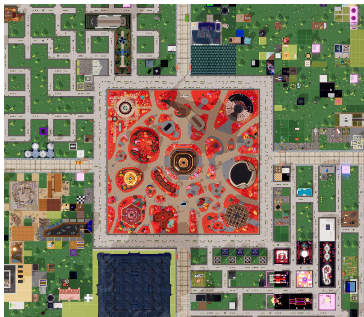
Figure 1. Decentraland's Map (Genesis City Map, 2023)

The Decentraland map consists of 90 districts, each with a different theme and function for public space settlement. These districts are connected to a main square located in the centre of the virtual city, known as Genesis Plaza. Genesis Plaza serves as the heart of the public space, facilitating socialisation, entertainment, and learning. Figure 1 shows the social centre of the platform located in the centre, the social area of Decentraland plaza, and the park.