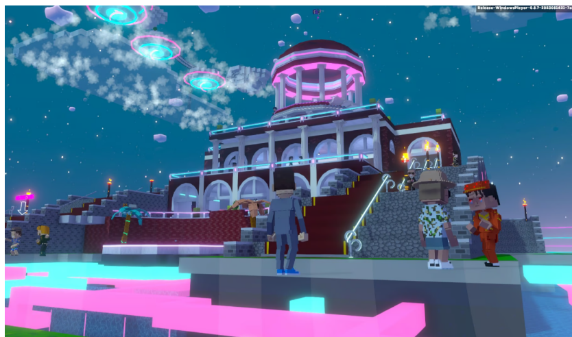
Figure 3. Elrond City Hub: Public Space Example (ElrondCityWhitePaper, 2023).

The Sandbox map is a web application that displays the different districts, lands, creators, and games of a virtual city. The Sandbox map has the following features in terms of public space settlement, usage, and urban planning: In terms of public space settlement, it consists of 166 districts with different themes and functions. These districts are connected to a main square located in the centre of the virtual city, known as the Elrond City Hub, as shown in Figure 3. Inside Elrond Hub, there are various centres such as the headquarters, metro, park, museum, hotel, casino, restaurant, airport, gaming centre, stadium, and rocket station. It has a decentralised system based on NFTs for participation (ElrondCityWhitePaper, 2023).