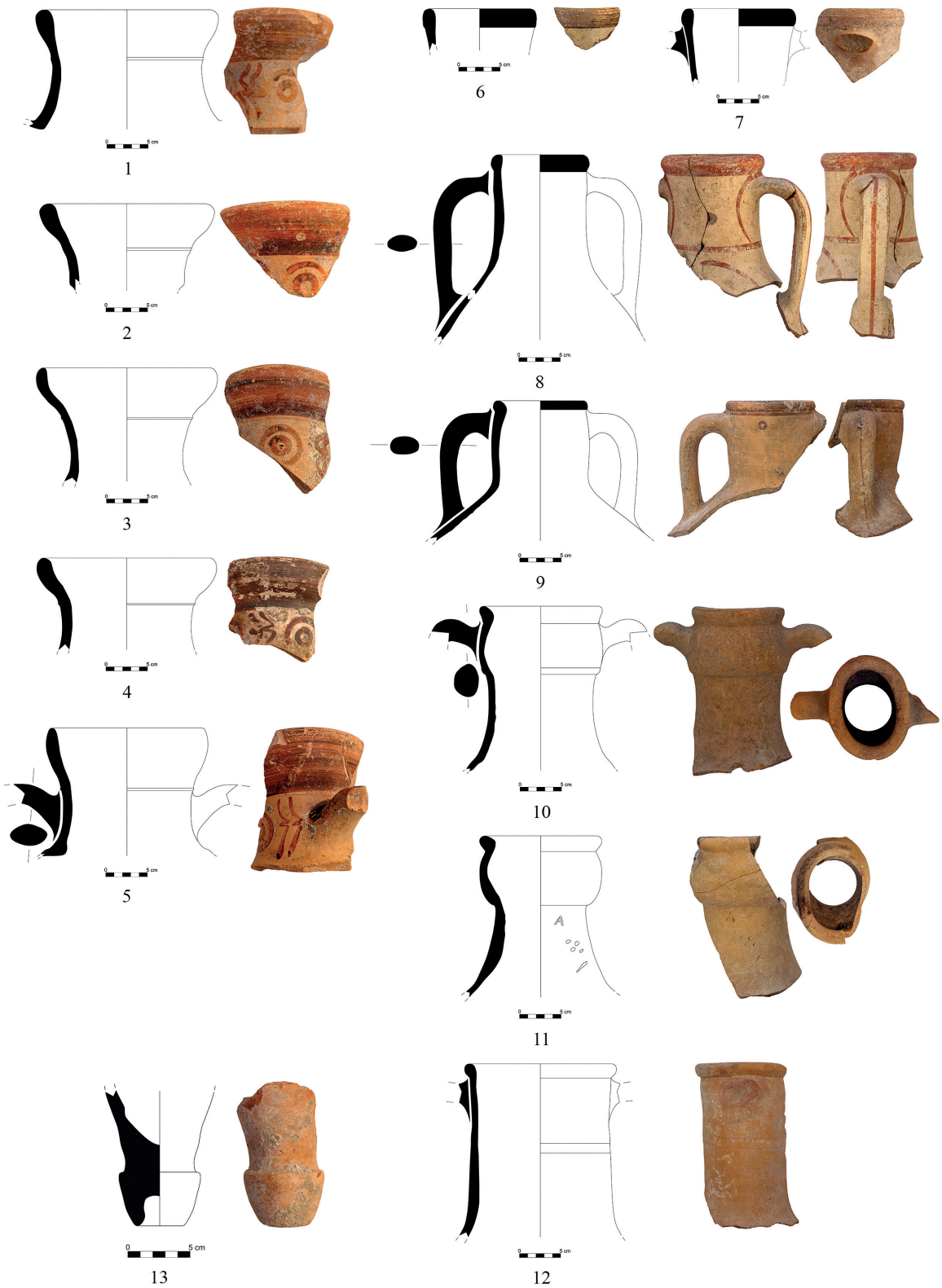
FIG. 2 Amphorae 1-13.