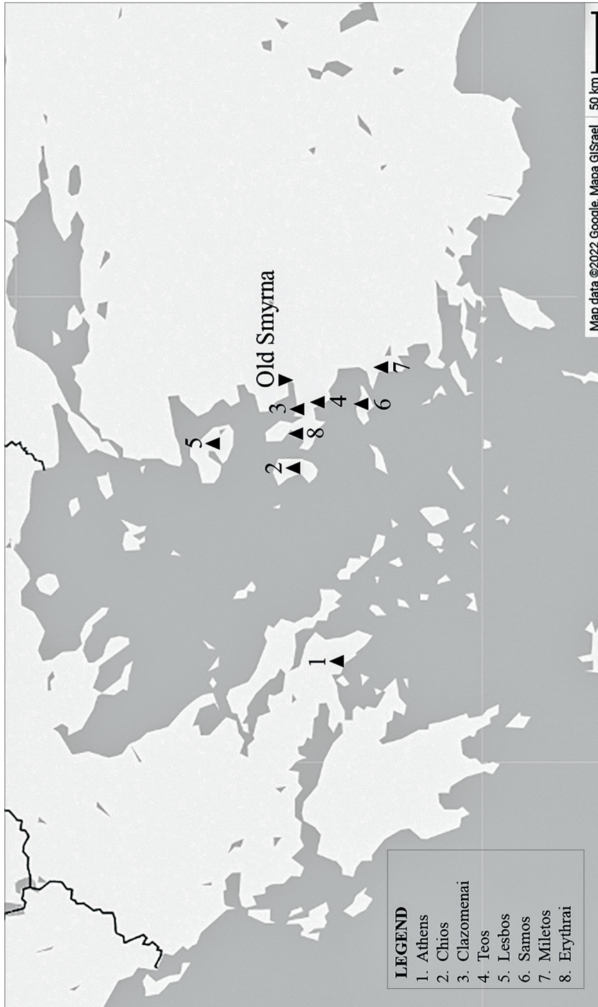
FIG. 1 Map of Sites in the Aegean.