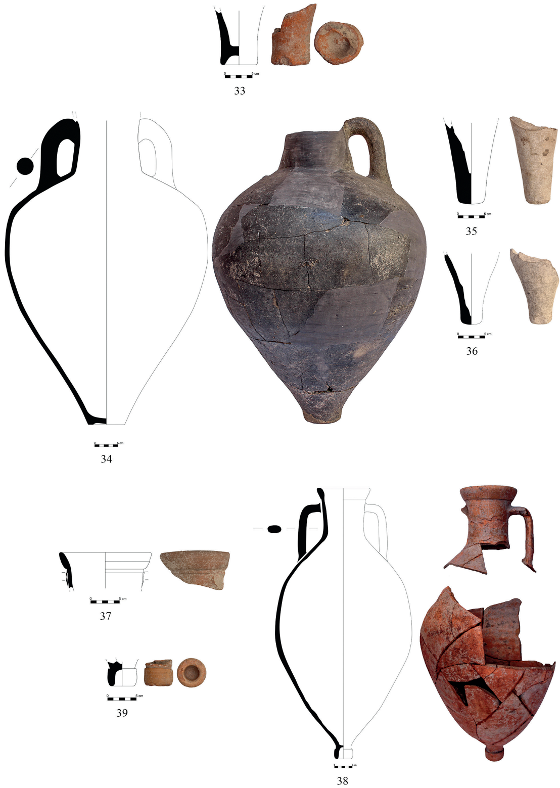
FIG. 4 Amphorae 33-39.