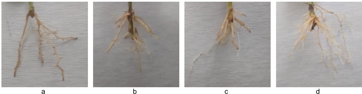
Figure 4. Root development by applications (a: Control, b: 2000 ppm, c: 4000 ppm, d: 8000 ppm).

There is a significant difference between the means with different letters (Duncan) within the error limits of P < 0.05 and P < 0.01 .