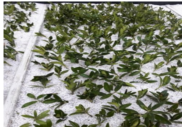
Figure 2. Rooting medium and appearance of rooted cuttings.

from one-year-old upright branches located on the upper part of the plant. To prevent drying during transportation from the collection area to the production unit, 10-15 cm-long shoots were cut, moistened and placed in plastic bags. The cuttings brought to the institute were kept in cold storage for one day and then taken into the planting process.