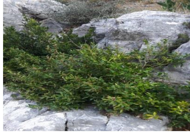
Figure 1. B. balearica location view.