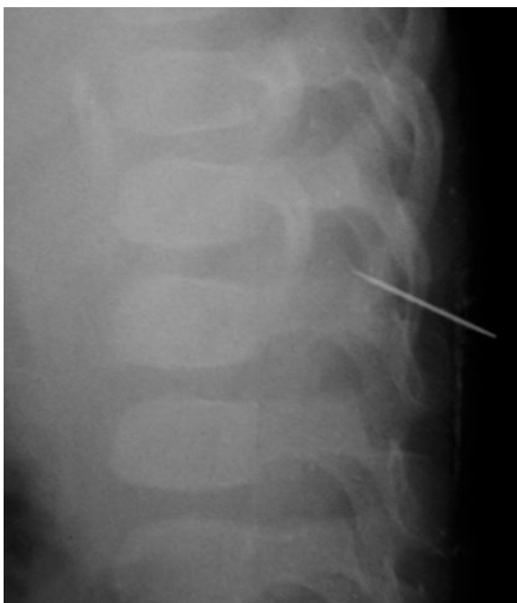
Fig. 1a. Lateral plain radiograph of the thoracolumbar spine showed a metallic foreign object.