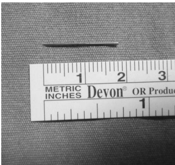
Fig. 2. Photograph of the sewing needle.

thoracolumbar (11%), and trauma to the lumbar region (14%) were rare. The etiology of such events include accidents due to motor vehicles (53%), falls (17%), neonatal trauma (6%), and injuries because of penetrating firearms (4%). Trauma due to penetrating foreign objects to the spine is rare. The instruments of such injuries include knives, wooden materials, glass, pencils, firearms, and as described herein, a sewing needle (4,6). Sometimes foreign objects are occult and may manifest by a complication (7,8).