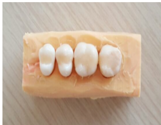
Figure 1. A sample of silicone blocks.

Premolar and molar teeth with approximal contacts were positioned in silicone blocks in a blind manner (Figure 1).