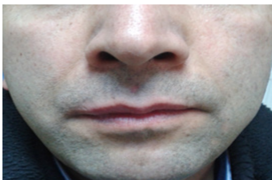
Figure 4. Image of the patient after steroid therapy of 26 days.