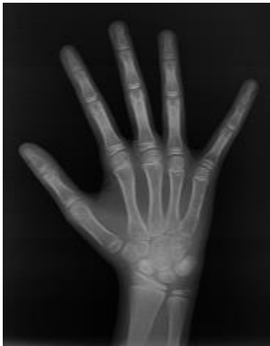
Figure 4. Hand-wrist radiograph.