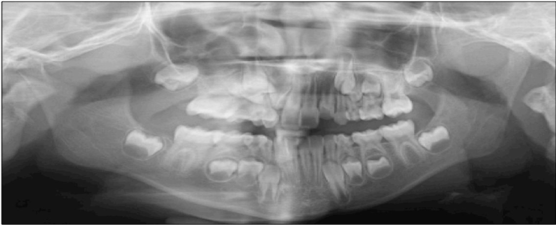
Figure 3. Panoramic radiography of the patient taken before dental treatment.