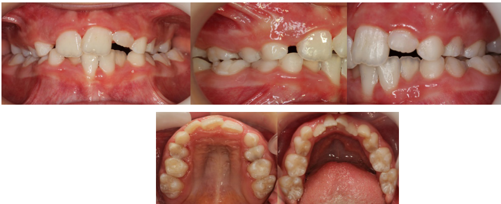
Figure 5. Intraoral photographs taken after restorative treatment was completed.

Marfan syndrome is a hereditary disorder that affects multiple organs and systems (4). Clinical appearance and severity of the condition varies among individuals with Marfan syndrome, even within the same family. The majority of people with Marfan syndrome do not have all the characteristic features and/or complications associated with this syndrome. In some cases, the condition may not be recognized by parents and may be asymptomatic (17, 18). In this case, all of the three systems, which are the most commonly affected by this syndrome, had malformations and her twin brother was healthy. Family history revealed no previously diagnosed individual in her family with this syndrome but her grandfather had suffered from heart disease and he had long limbs.