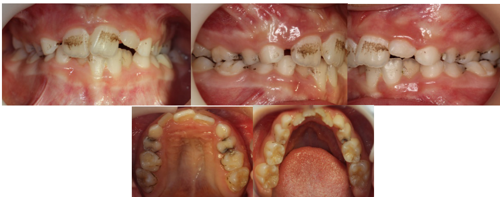
Figure 2. Pretreatment clinical photographs showing profound caries and stains on teeth.