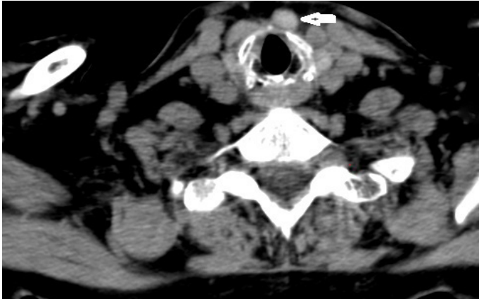
Figure 1. Thorax CT: A cystic lesion approximately 40x38 mm in size was seen in right side of thyroid gland.

tient was taken to the operation room for a cervical collar incision. A cystic lesion of about 4 cm was found at lateral trachea during the operation (Figure 2). The cystic lesion was resected together with the soft tissues surrounding it. The cyst was excised without being ruptured. The patient was discharged without any problems on the second day following the operation. The patient's pathology was reported as thymic cyst. The patient was followed 28 month without and any recurrence.