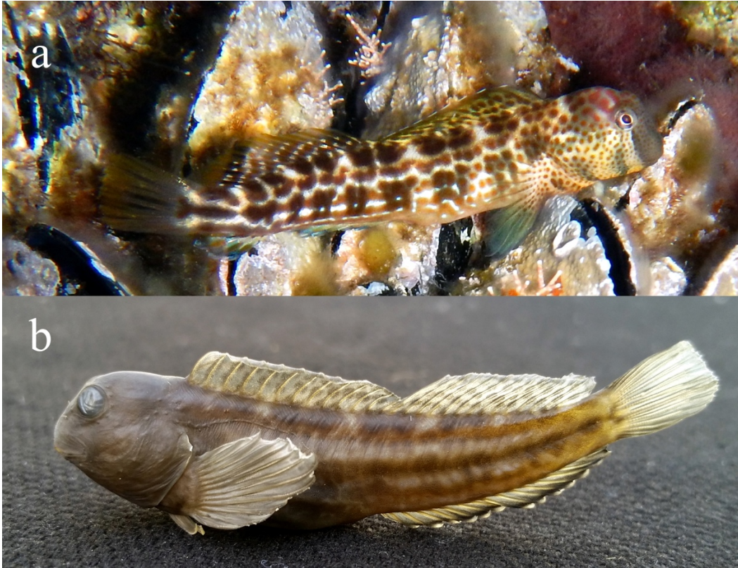
Figure 4. Photographs of Microlipophrys caneavae ; mussel covered rocky habitat, Gökçeada Island, 0.5 m (a), fixed sample (b).