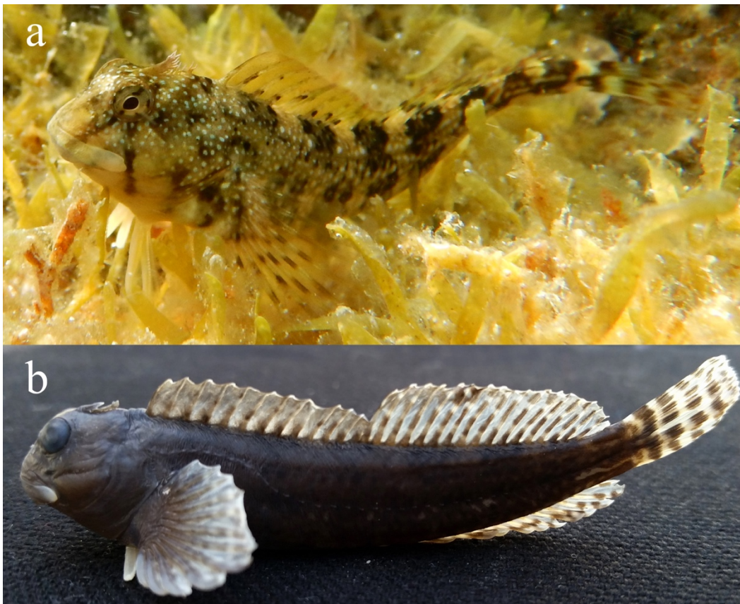
Figure 5. Photographs of Coryphoblennius galerita ; algae covered rocky habitat, Gökçeada Island, 0.5 m (a), fixed sample (b).