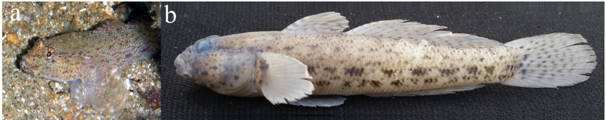
Figure 2. Photographs of Gobius bucchichi ; sandy bottom, Gökçeada Island, 3 m (a), fixed sample (b).