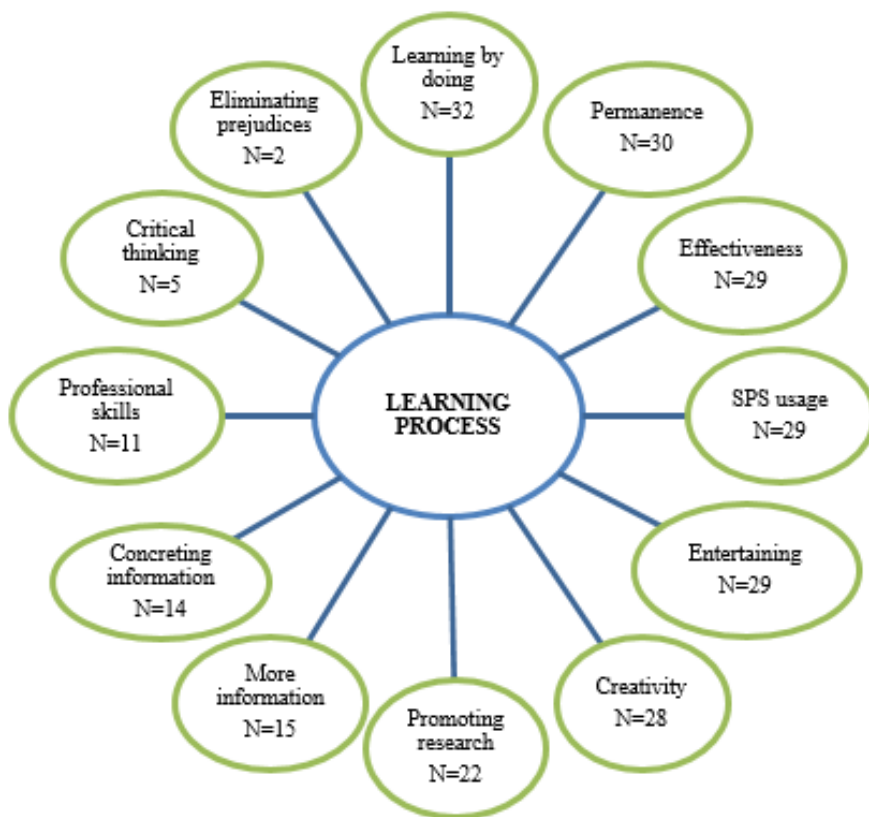
Figure 1. Codes under the theme “Learning Process”

Descriptive analysis presented the answers under specific themes and codes. According to these findings, the answers given by pre-service teachers were collected under three main titles: “Features of the learning process”, “Challenges encountered during learning” and “Suggestions”. These three main titles, which were ascertained as the theme, formed the frame of the sub-titles (codes) under which the answers were classified in detail. The related codes were written under each theme and the number of repetition of the codes was estimated. Later, the codes were sorted according to the number of repetitions and a scheme was created for each theme. Figure 1 shows the codes under the theme “Learning Process” that evaluate the characteristics of the process of learning and the number of people who stated these codes.