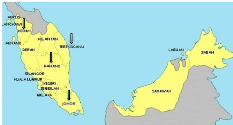
Figure 1. Study area location.