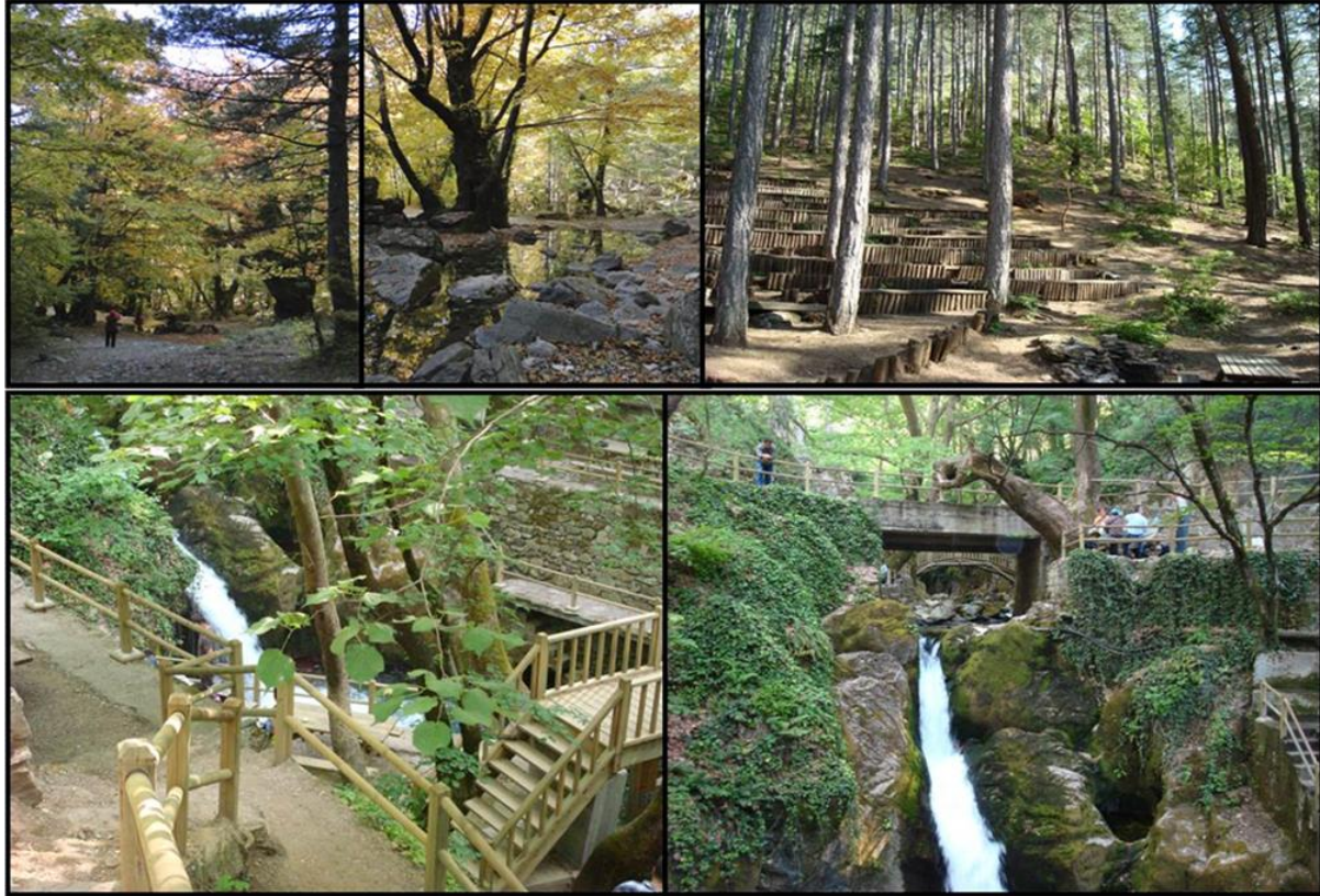
Figure 2. Waterfall and various images from the study area (Original, 2017).

and a higher rate of cloudiness in comparison with the actual Mediterranean climate. This is a significant factor in recreationally preferring the study area in hot summer months. The study area has visually rich scenic examples together with its rich vegetation besides the brook passing through it and the resulting waterfall (Figure 2). Additionally, ecological tourism activities particularly like trekking in the forest are also among the activities frequently encountered in the area thanks to the richness of the biodiversity.