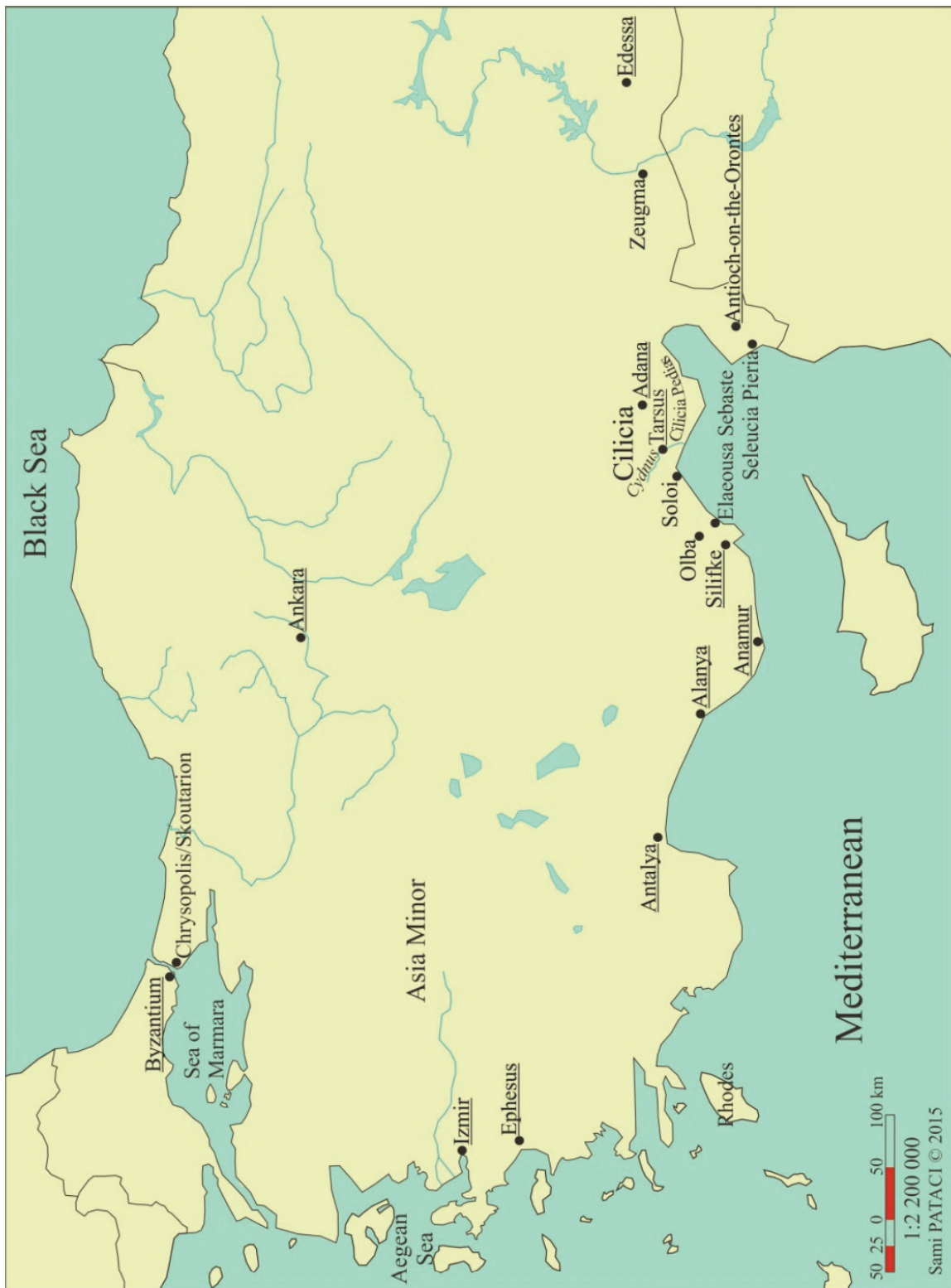
Map 1) Map of Tarsus, Cilicia and other quoted places in the text. Underlined places indicate cities with local museums (S. Pataci, 2015).