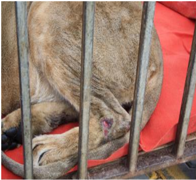
Figure 4: Dermal lesions

was able to continue his duty in circus performances sturdily.