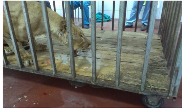
Figure 1: Vomiting

White blood cell counts revealed 21.780 cells/ \mu\text{l} (mean 11.8 \times 10^3 cells/ \mu\text{l} ). Hematocrits; 51.99% ( x=34.4\% ), with an MCV of 41 fl ( x=51.6 fl) (Table 1). The case was positive for H. felis by microscopic examination of freshly prepared Giemsa-stained blood smears (Figure 3). The lion in this study tested negative for FeLV and FIV and FIP. Blood urea (399 mg/dl) and creatine (21.9 mg/dl) levels were elevated (Table 2). No pathological findings were detected by urine examination.