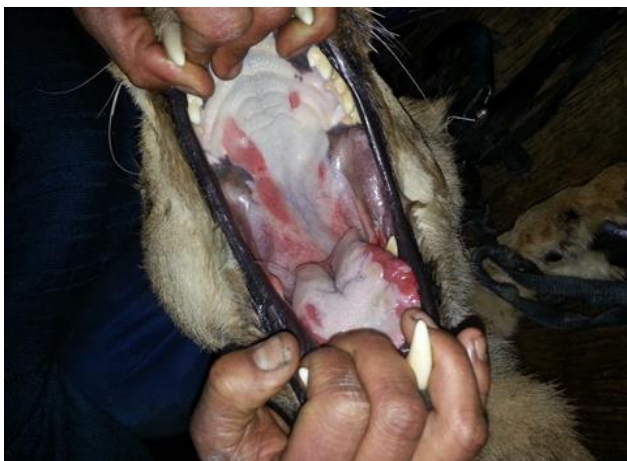
Figure 1: Mucosal ulcers and erosions in the mouth of lion

A two-year old female lion ( Panthero leo ) was presented to our clinic with nasal and oral bleeding weighing as 155 kg (Figure 1), vomiting (Figure 2) and anemia. As being informed by the owner; the lion had a history of anorexia, nasal discharge, fatigue, dehydration, apathy existed about one month. At the physical examination: mucous membranes color had been altered from white to yellow. Anesthetic agents were administered i.m. three times during hospitalization of lioness (xylazine and ketamine). Blood was collected following anesthesia. Blood sample was drawn from the saphenous vein into tubes coated with ethylene diamine tetra acetic acid (EDTA) and serum tube. A fresh blood smear was made immediately after blood collection and stained with Wright–Giemsa. Complete blood counts were performed immediately. A combined test kit for FIV antibodies and FeLV antigen was used. Serum biochemistry values were detected.