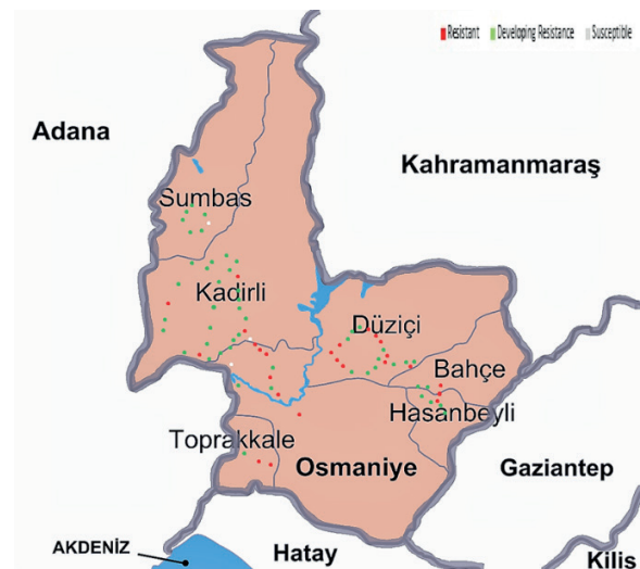
Figure 2. Sampling locations and their resistance to Clodinafop in Osmaniye Province in 2015.

By 2015, rates of resistant fields was 33.75%, developing resistance was 62.5% and susceptible fields was 3.75%. Coordinates were entered and Osmaniye resistance map against the ACCase inhibitor clodinafop-propargyl was created in Figure 2.