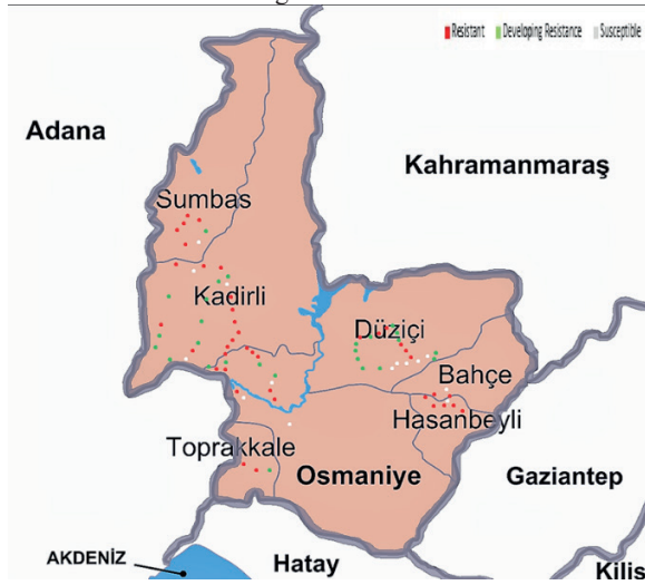
Figure 3. Sampling locations and their resistance to Mesosulfuron-methyl + Iodosulfuron-methyl sodium in Osmaniye Province in 2015.

was 17.5%. Osmaniye resistance map against the ALS inhibitor herbicide mesosulfuron-methyl + iodosulfuron-methyl sodium was formed in Figure 3.