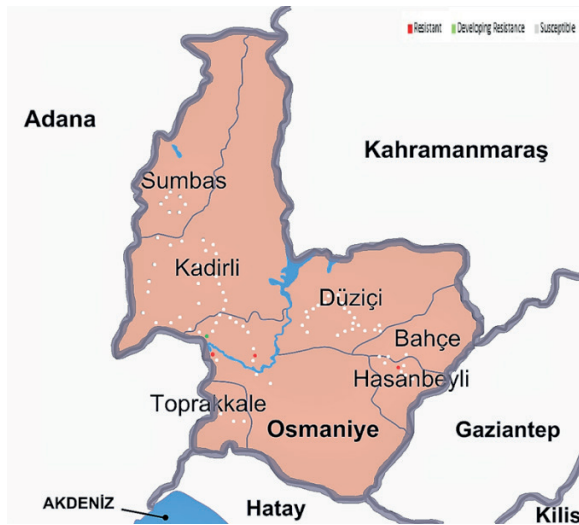
Figure 4. Sampling locations and their resistance to Pyroxsulam in Osmaniye Province in 2015.

The population surveyed last year demonstrated that The rates of 95% were susceptible to pyroxsulam, 1.25% developing resistance and 3.75% were resistant. The map of resistance to pyroxsulam in 2015 was created in Figure 4.