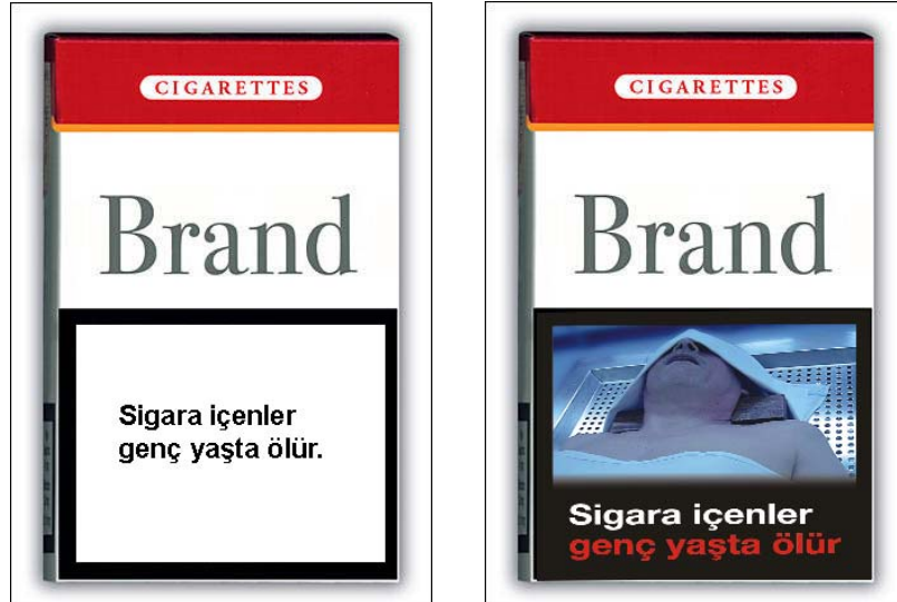
Example of Written Text Warning Example of Combined Warning

are present in cigarette smoke," "Smoking causes fatal lung cancer," "Smoking makes skin age earlier," "Smoking blocks blood vessels, and it causes heart attacks and paralysis," "Smokers die at a younger age," "Smoking causes painful and slow deaths." Figure 2 shows examples prepared for the A and B warning groups. Next, the packets were prepared for the A and B groups separately in the form of presentations. Having received the permissions required, the written text warning presentation for group A and the combined warning presentation for group B were given in the classrooms for 25 minutes each. The questions asked were answered in both groups before and after the presentations. At the end of the presentations, students' thoughts and feelings were obtained through a questionnaire distributed to them. The administration lasted approximately one class hour. The application of the research was performed between September 2014 and April 2015.